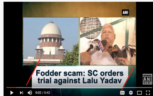
SC orders trial against Lalu Yadav